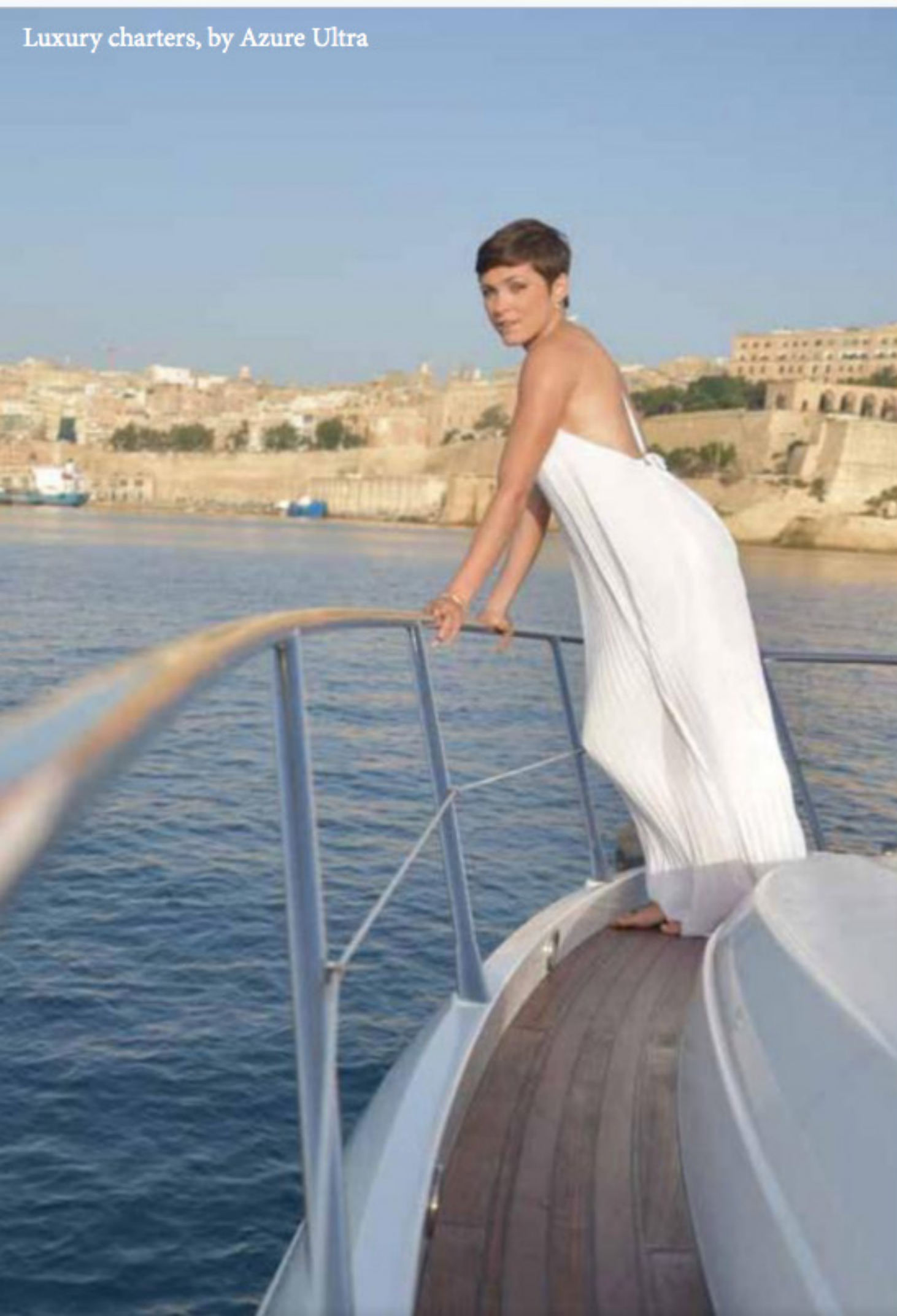
Luxury charters, by Azure Ultra