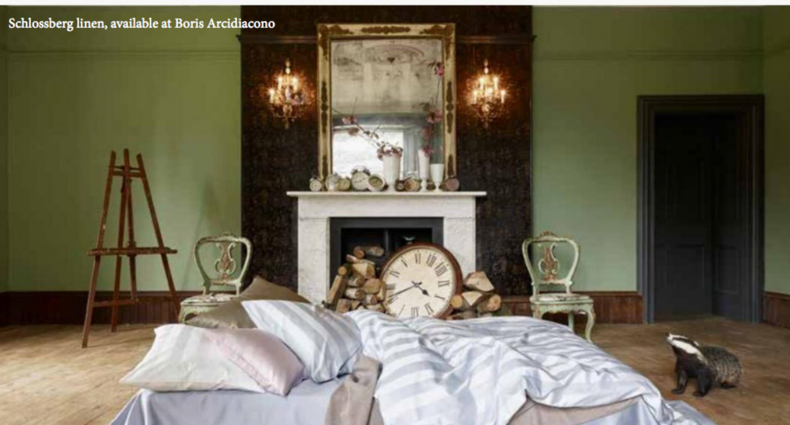
Schlossberg linen, available at Boris Arcidiacono

"Luxury is, in fact, all about the experience of having something done, the way you want it, within a timeframe that suits you, utilising the very best materials, techniques or knowledge."